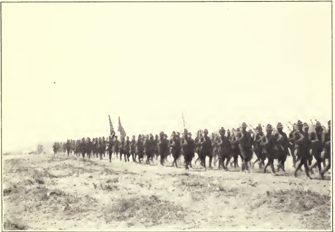
AN OHIO COMPANY